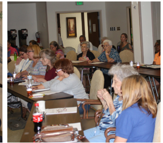
Family tree enthusiasts