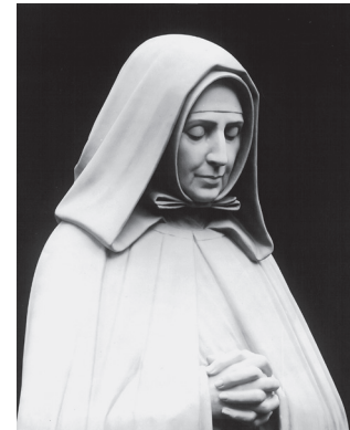
Our Foundress, Saint Jeanne Jugan, 1792-1879