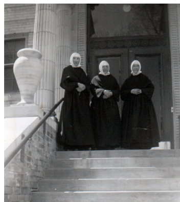
Sisters preparing to greet guests to Mullen Home, 1942

Friday, December 29: Mass at the Denver Cathedral dedicated to the Little Sisters’ Mullen Home for the Aged.