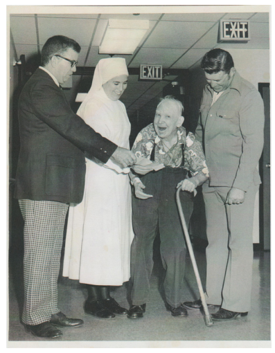
Mullen Home Resident - 1970s

Medicare, Medicaid, and other retirement benefits cover only 59% of our expenses toward a safe and comfortable home for our Residents. You can help – and be a big winner too!! Proceeds from our raffle benefit our Residents daily personal care throughout the year!