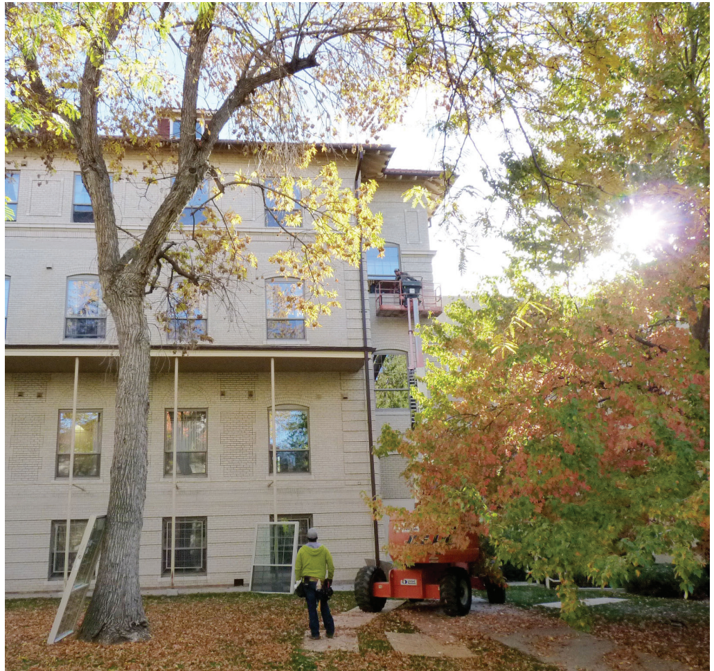
A beautiful fall day was perfect for over 20 workers from Champion Windows to begin the daunting task of replacing 194 windows. It took two weeks and diligent expertise and was certainly not for the 'faint of heart'! Thank you Champion Windows for a job well done.

Projects for the upkeep of our Home are ongoing and necessary to maintaining a safe and secure environment for our Residents, staff, volunteers, Sisters, and visitors. We are blessed with the many gifts and donations we receive each year. Thank you all for keeping us in your thoughts of those in need.