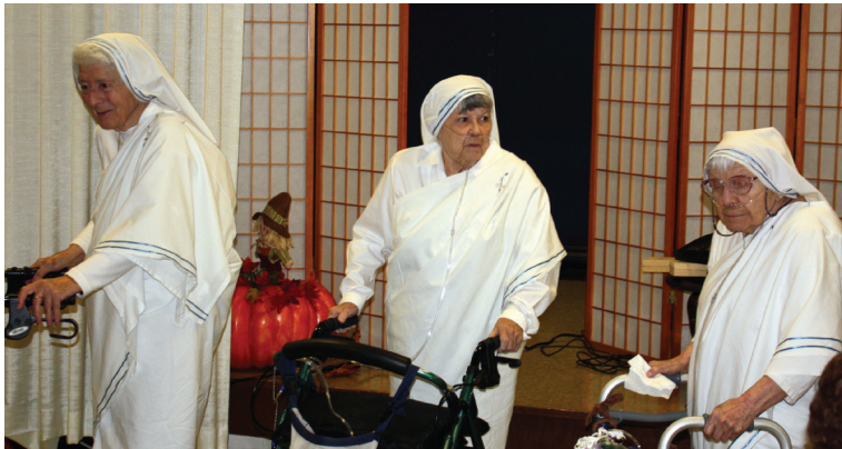
Three Residents loved participating as the Missionaries of Charity of Calcutta as they accompanied Saint Teresa.

other notables. The grand finale was the 'Pope mobile' with the newly sainted Pope John Paul II making his entrance surrounded by his secret service detail! After an hour of good fun and laughter, the parade came to a close with root beer floats for everyone.