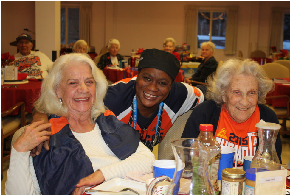
Residents and staff come together for a rousing Super Bowl party ... and to watch the Broncos win!