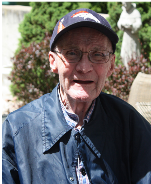
“SAY A HAIL MARY FOR THE BRONCOS!”