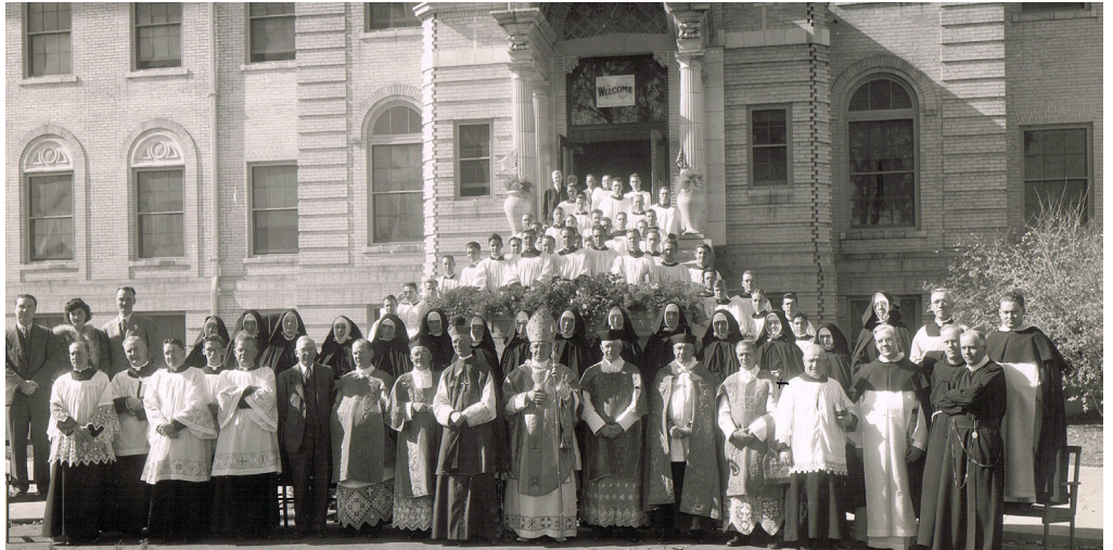
In 1939 - Little Sisters and honored guests observe Saint Jeanne Jugan's 100-Year Anniversary of Serving the elderly poor.

Visit us at www.littlesistersofthepoordenver.org