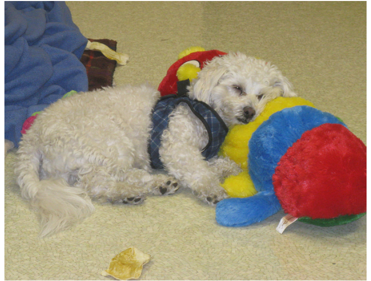
"Sometimes I just have to rest from all the activities," muses Francisco the dog who is a new addition to the Activities Department!