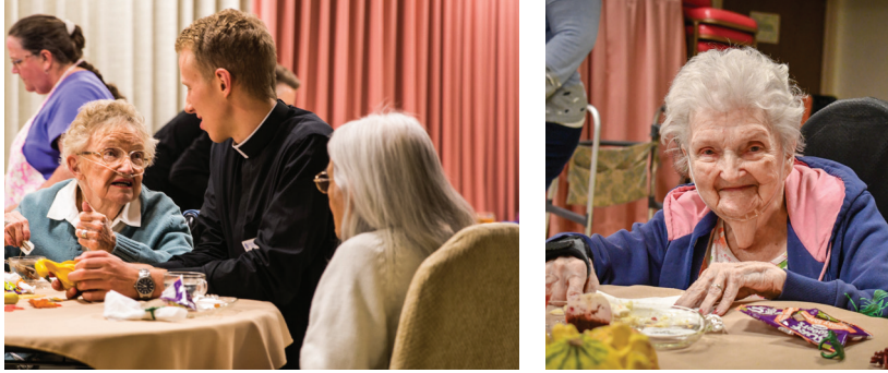
HARVEST TEA PARTY: October 11: A beautiful celebration of fall, centered around a relaxing tea party, became a welcome celebration for friends, staff, and volunteers to visit and reminisce.