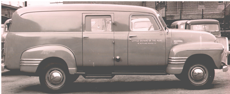
1950's: The new begging van, a 1949 Chevrolet 3800 Panel Delivery Truck.