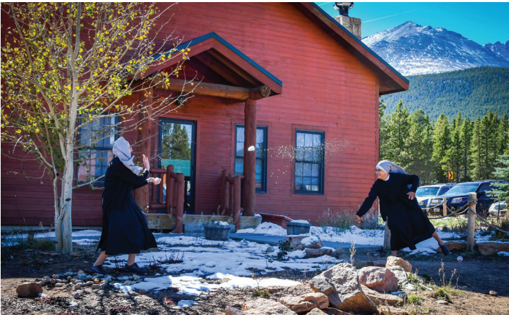
SISTERS VISIT ESTES PARK: October 13: The Sisters visited a historic chapel in Estes Park to speak about vocations and the Sisters' work with Denver's aging community. They even took a moment to enjoy a little snow ball fight!