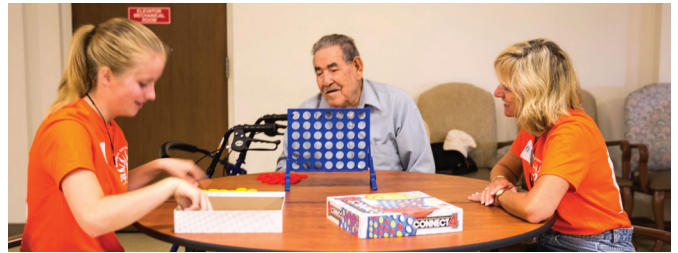
BOARD GAMES WITH REGIS STUDENTS: September 8: Regis High School students stopped by the Home on a Saturday morning to break out the board games and have some fun with the Residents and Sisters.