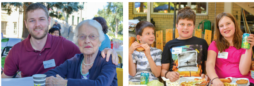
FALL FAMILY PICNIC: September 22: This year's Fall Family Picnic was bigger than ever and featured numerous guests, volunteers, staff, and their families celebrating one of this year's last warm days on Mullen Home's scenic, park-like, grounds.