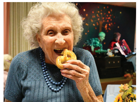
JOLLY MONK: October 12: Mullen Home Residents loved the mesmerizing accordion music played this month at a party known as "Jolly Monk". This recurring event provides a variety of entertainment which Residents often enjoy along with a refreshing drink and snack.