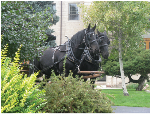
The horses await...

that immediately warm the soul! Two wagon loads later, after a nice leisurely drive around the Highlands neighborhood, Residents, staff, and volunteers give a heartfelt cheer and thank you to the horses and their drivers – then rush inside just as the skies open to a chilly rain!