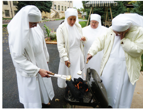
S'mores are cooked...