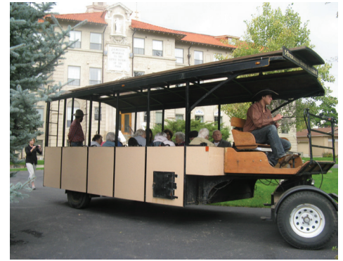
And they're on their way!