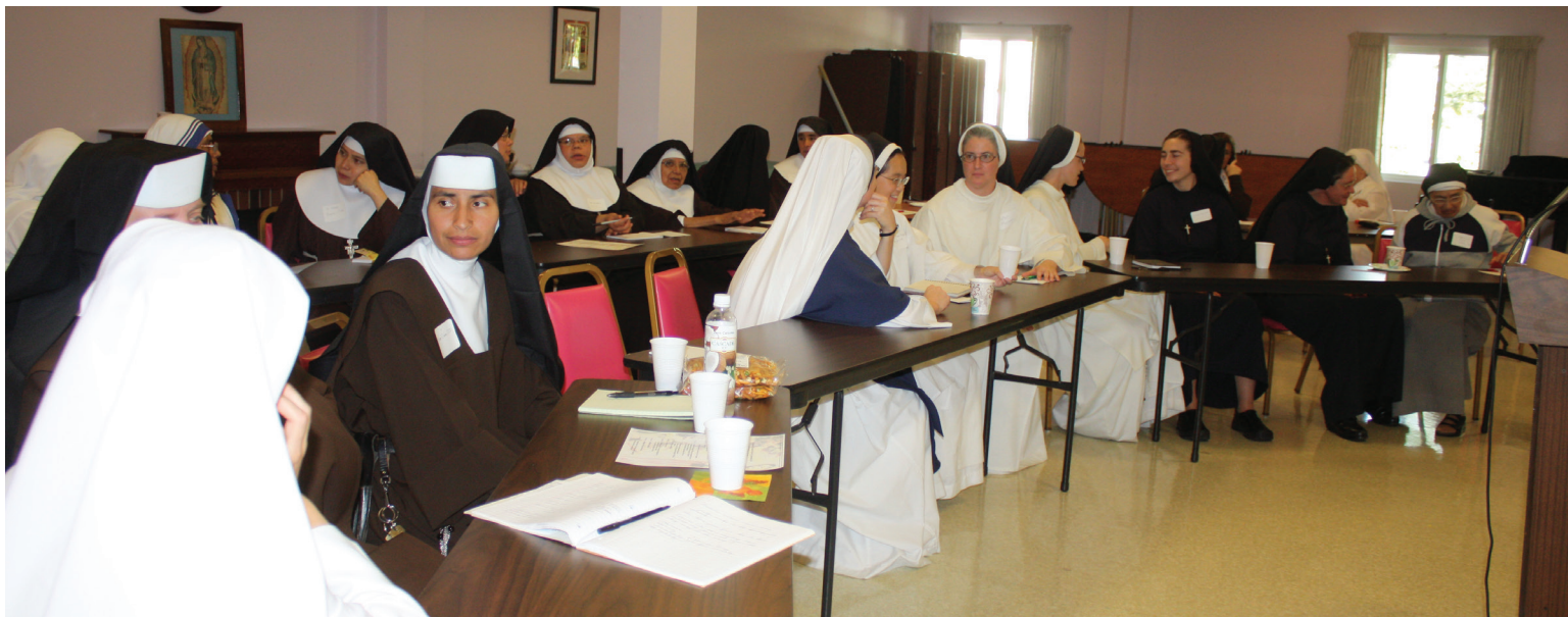
Sisters of various congregations gather in the Mullen Home auditorium for a day of sharing and discussion of consecrated life.