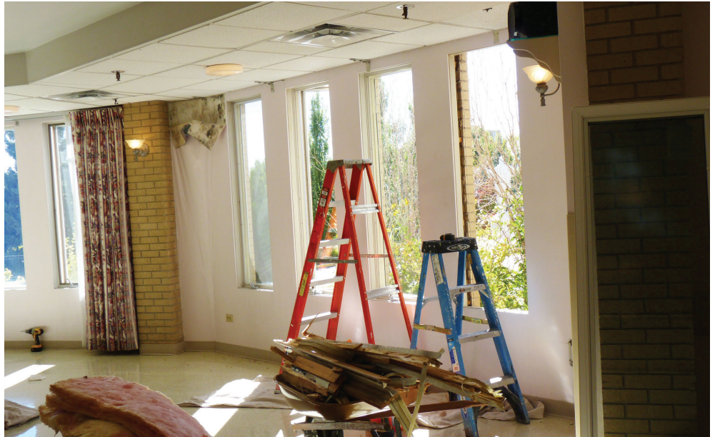
Double-paned windows are being installed throughout the old dining room area as a full renovation of the facility gets underway.

The dining room is being updated and reconfigured to provide a more comfortable, serviceable area. Residents will enjoy a hot buffet serving station, new kitchen features with easy accessibility, and beautiful new double-paned windows to keep the cold air out or the summer heat at bay. Flooring is being changed